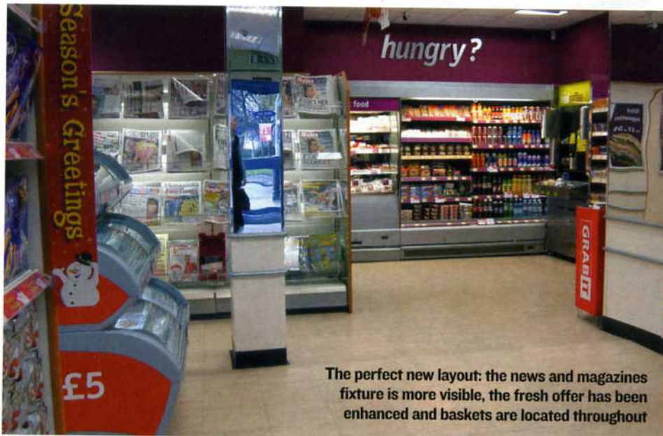
The perfect new layout: the news and magazines fixture is more visible, the fresh offer has been enhanced and baskets are located throughout