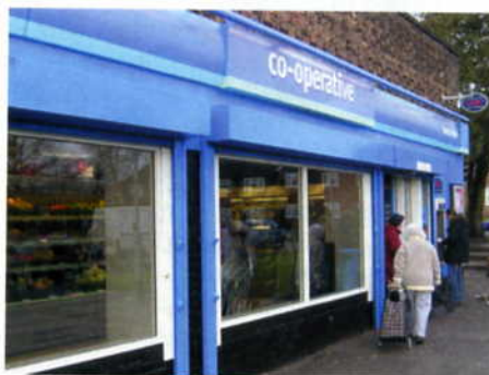
Visibility is a key philosophy at Bradwell